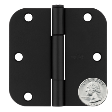
5/8" RADIUS CORNER

A quarter matches up to the 5/8" radius.