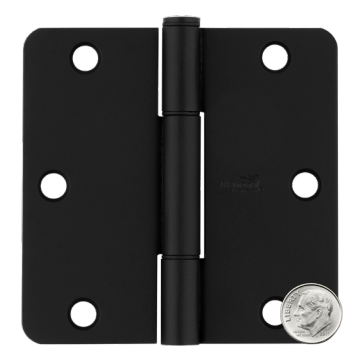
1/4" RADIUS CORNER

Radius corner and square corner hinges offer the same functionality. If you're installing hinges on a new door, you can simply choose the look (square or round) you prefer.